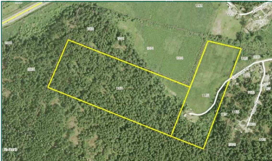
Orthophoto map of Lohbrunner Farm on Vancouver Island