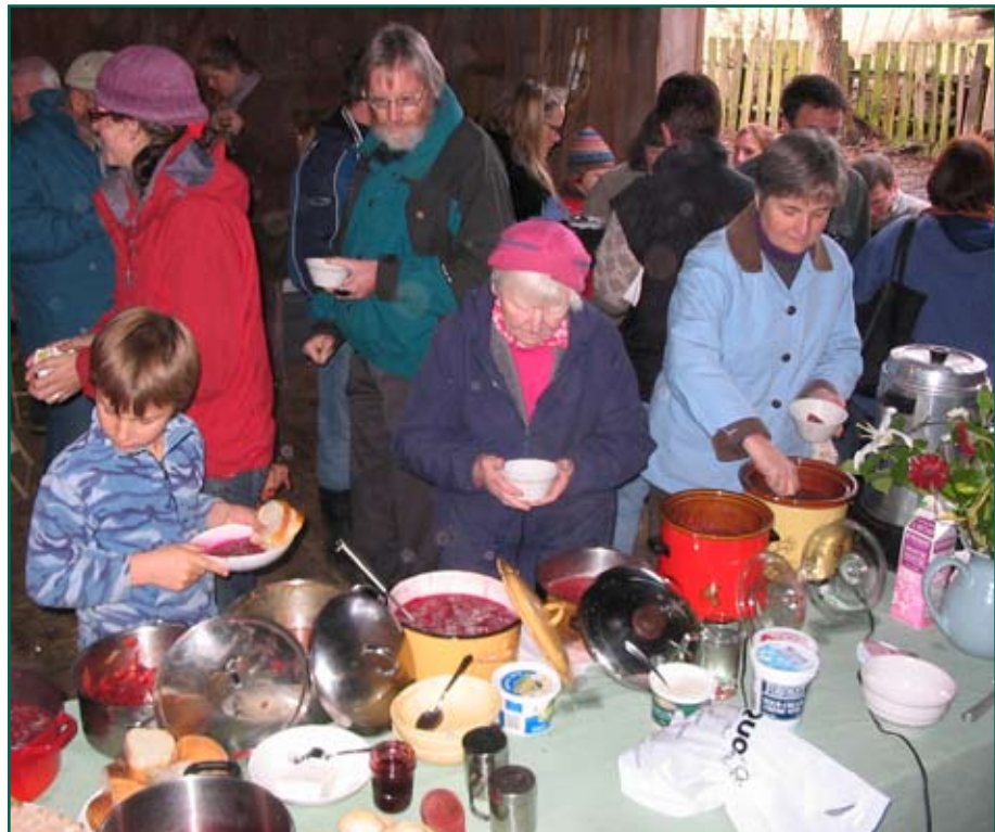
Borscht competition, Keating Community Farm