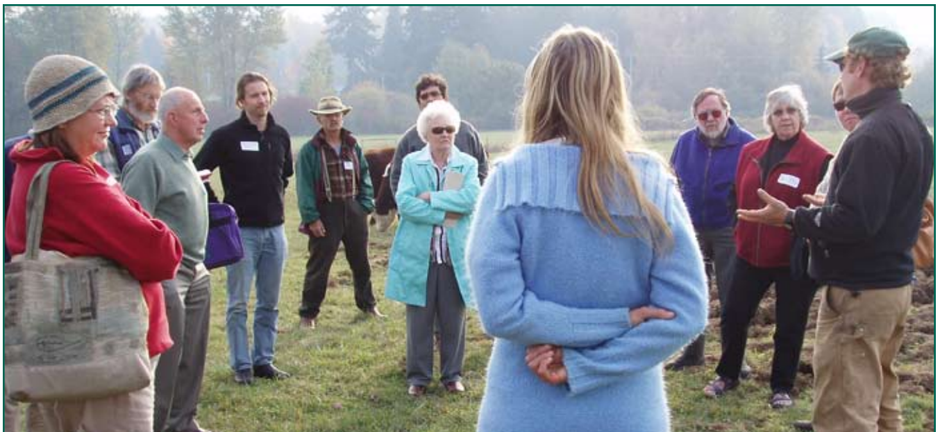
Members meeting at Keating Community Farm

Please refer to Section 3, Land – Inventory and Assessment for detailed information about each step.